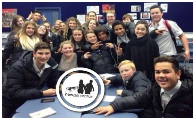
New Generation school group